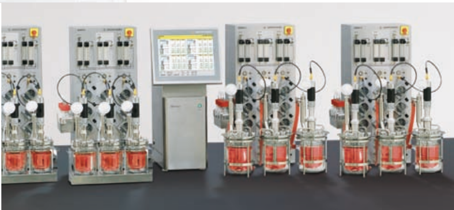
Parallel and fully independent control of up to twelve scalable culture vessels with BIOSTAT® Q plus

Sartorius Stedim Biotech performs process modelling to provide the widest variety of pace-setting agitation and gassing strategies for its reusable and single-use bioreactor portfolio. This gives you a real choice to suit your specific application needs.