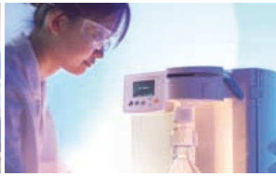
arium® for ultrapure water in media preparation and analytical applications