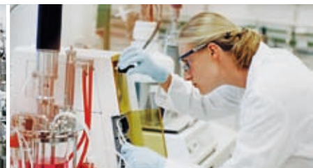
Autoclavable BIOSTAT® A plus fermentor system for educational and R&D applications