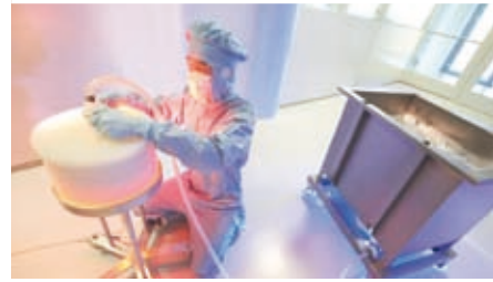
Bottom: Process-scale multilayer single-use depth filter for initial recovery in cell culture processes