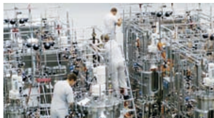
Engineering and installation of process-scale production lines at Sartorius Stedim Systems in Melsungen, Germany