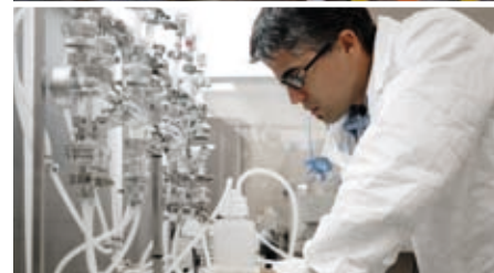
Top: Production of single-use bags in Aubagne, France