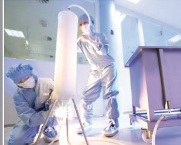
Membrane chromatography with Sartobind® Q Mega

Single-use technologies and equipment from Sartorius Stedim Biotech enable you to meet the rapidly changing requirements of the biopharmaceutical industry. Join our regular customers who rely on Sartorius Stedim Biotech single-use products in all biopharmaceutical process phases to enhance their production capacity and