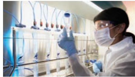
Top: Virus filtration with single-use Virosart® CPV filter capsules

Our highly knowledgeable and experienced application specialists are eager to assist you on site for developing your applications and implementing your processes – all over the world. Sartorius Stedim Biotech is your partner of choice for state-of-the-art initial recovery and contaminant removal.