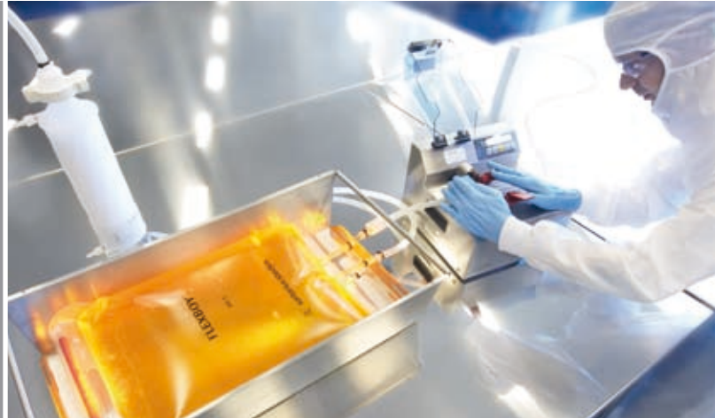
Sterile tube fusing with BioWelder™

Sartorius Stedim Biotech is the pioneer and leader in single-use systems and aseptic transfer systems, with the most extensive capabilities for creating fully integrated solutions. Flexel® and Flexboy® bags have proven their efficacy over a million times in single-use fluid management applications. And our solutions for freeze-thaw processing are sophisticated beyond state-of-the-art technology.