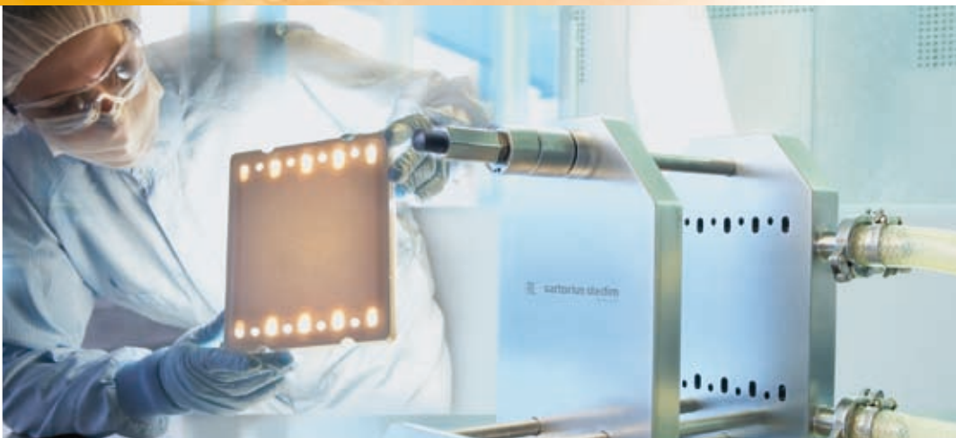
Ultrafiltration with Sartocoon® crossflow cassettes