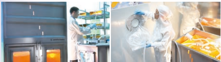
1500 L Palletank®