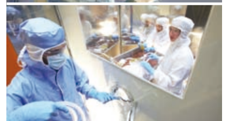
Top: MaxiCaps® for upstream and downstream applications