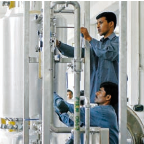
Engineering of process-scale production lines in Bangalore