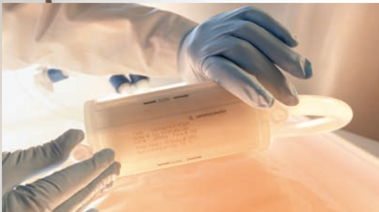
Single-use MidiCaps® sterilizing-grade filter

Sartorius Stedim Biotech's filtration performance is not just limited to providing outstanding flow rates, throughputs or yield enhancements. It is also supported by a rigorous quality and process control system to guarantee the highest batch-to-batch consistency, quality and traceability. Moreover, our knowledgeable experts who actively shape regulatory policies provide application and validation services to ensure your regulatory compliance, no matter where you are in the world.