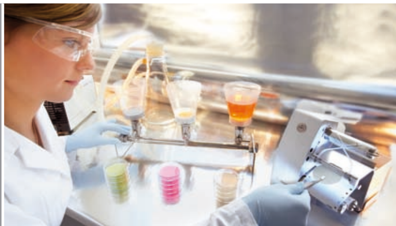
Biosart® single-use funnels and Microsart® e.Motion filter dispenser for colony count applications