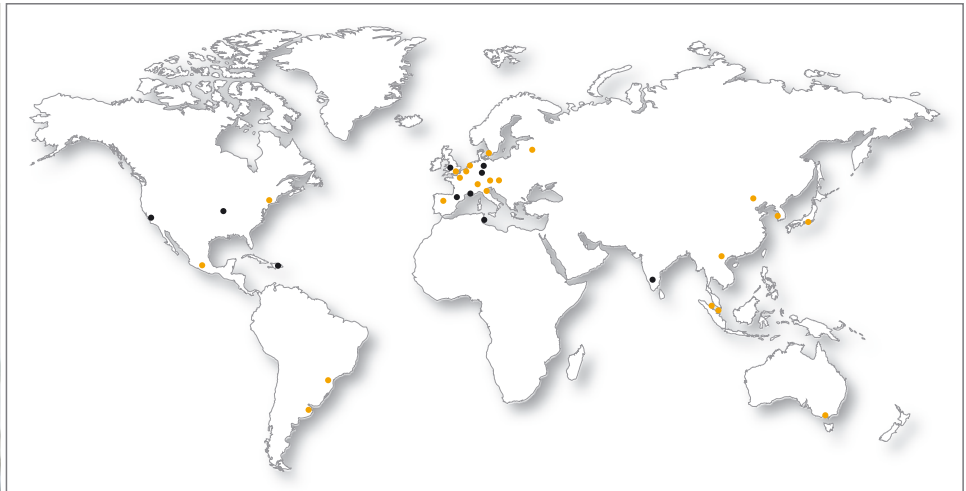
● Sales ● Production | Production and sales