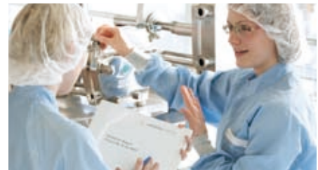
Top: Instrument services – we take our responsibilities seriously in order to ensure your productivity